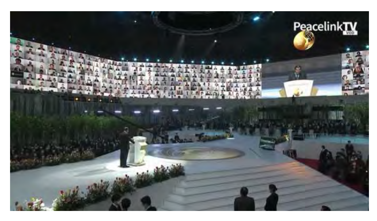
Part I: Awards Ceremony

South Korea -- The Sunhak Peace Prize was instituted in 2014 under the peace vision advocated by the founders of the Universal Peace Federation: "One Family of Humanity under God." The fifth award ceremony focused on the "response to the global pandemic," and was held on February 12th at the HJ Global Arts Center and live streamed to the Lotte Hotel World in Seoul.